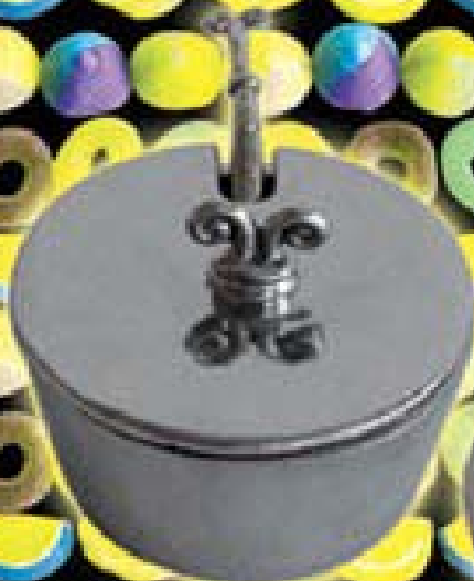
18/8-aries design all cast aluminium h=6.5cm d=11cm