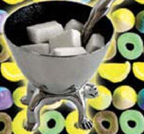
CBFA-backbend design stainless steel bowl+pewter base h=7cm d=9cm