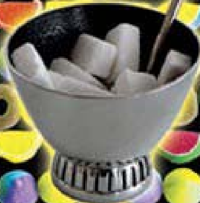
CBFA-moghal design spun pewter+base h=7cm d=9cm changing to stainless steel