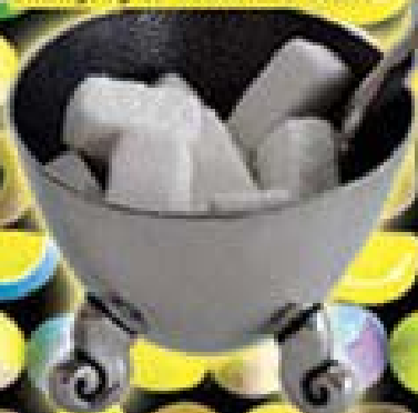
CBFA-wave design spun pewter+base h=7cm d=9cm changing to stainless steel