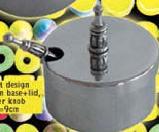
CBFA-soviet design spun aluminium base+lid, with pewter knob h=8cm d=9cm