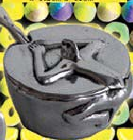
18/8-swimming man design all cast aluminium h=5.5cm d=11cm