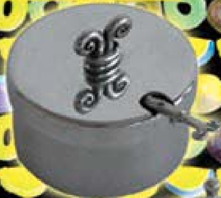
CBFA-aries design, spun aluminium base+lid, with pewter knob h=7cm d=9cm