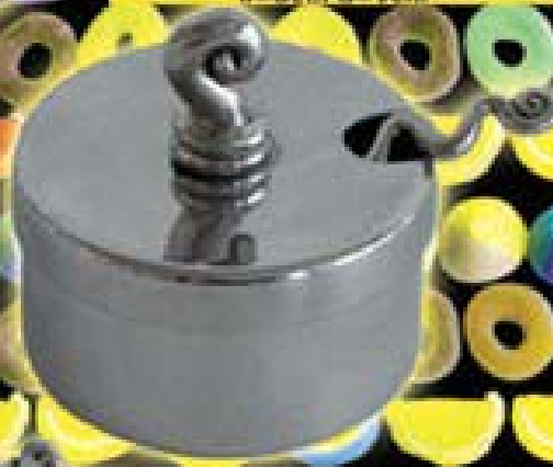
CBFA-wave design spun aluminium base+lid, with pewter knob h=8cm d=9cm