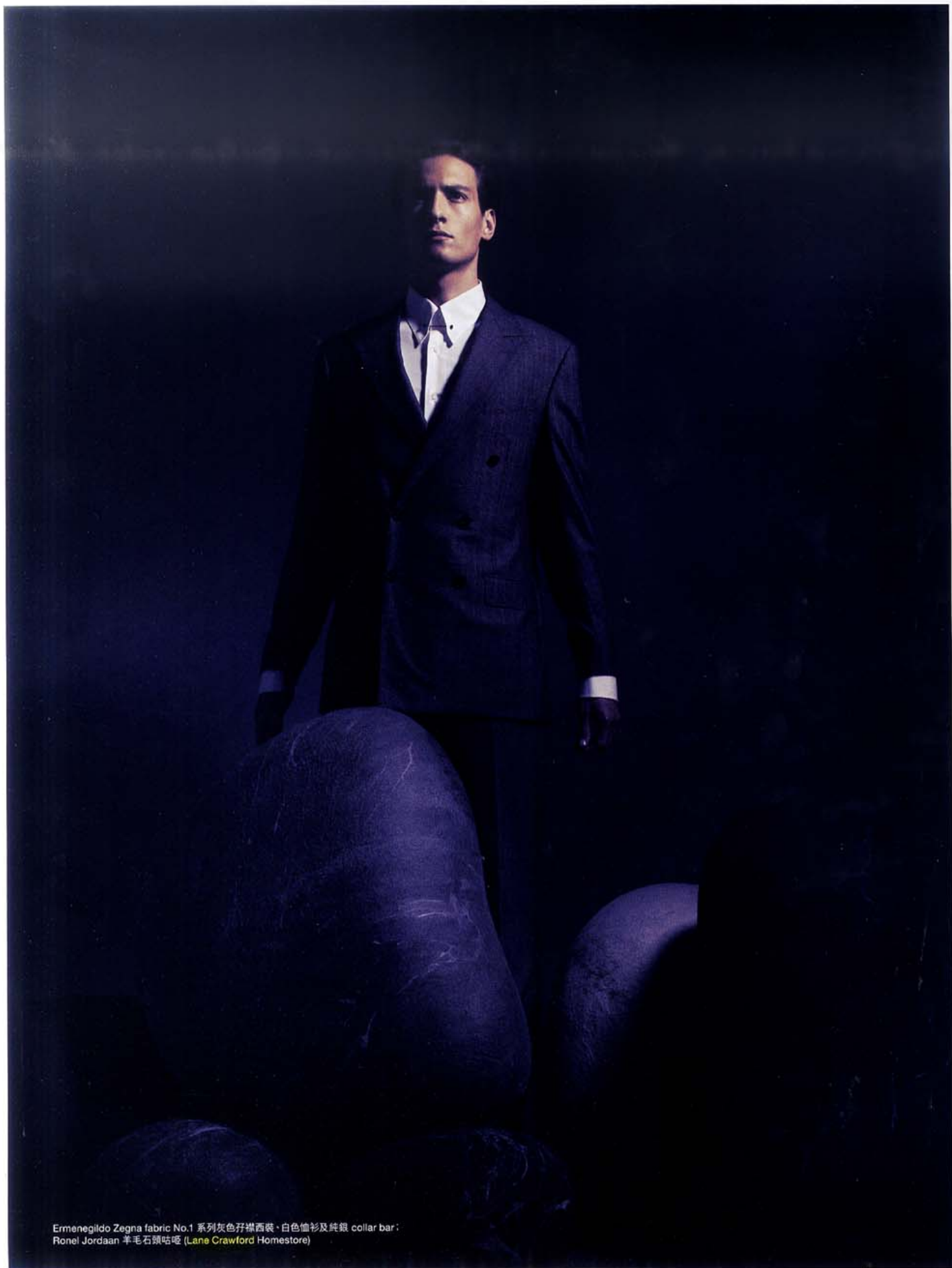
Ermenegildo Zegna fabric No.1 系列灰色孖襟西裝·白色恤衫及純銀 collar bar ; Ronel Jordaan 羊毛石頭咕啞 (Lane Crawford Homestore)